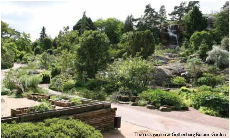
The rock garden at Gothenburg Botanic Garden