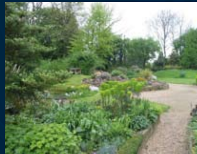
Sue & Robin White's garden

Tour 2- Gardens of the South East and East Anglia from Sunday April 10th – Thursday April 14th will leave from Wisley on April 10th and visit mostly private gardens in the South East and East Anglia before heading north to visit the AGS Centre Garden at Pershore and another private garden and nursery before driving on to the Conference in Nottingham on April 14th. Travel will again be by coach with Bed and Breakfast at comfortable hotels to include 2 nights at Holiday Inn, Guildford, 1 night Holiday Inn, Colchester, 1 night en route to AGS Pershore., tbc.