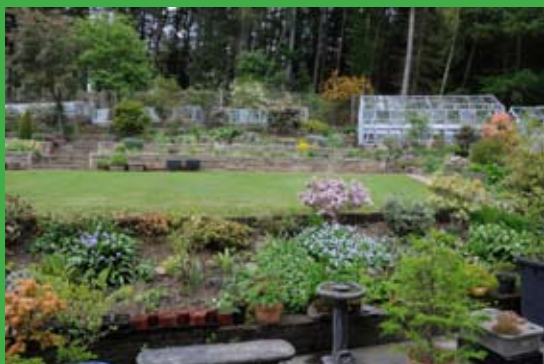
The Explorers Garden