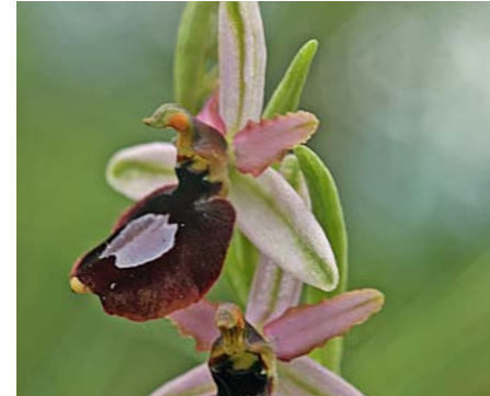
Ophrys drumana and Cypripedium calceolus

Call Greentours on 01298 83563, email enquiries@greentours.co.uk or visit the website at www.greentours.co.uk