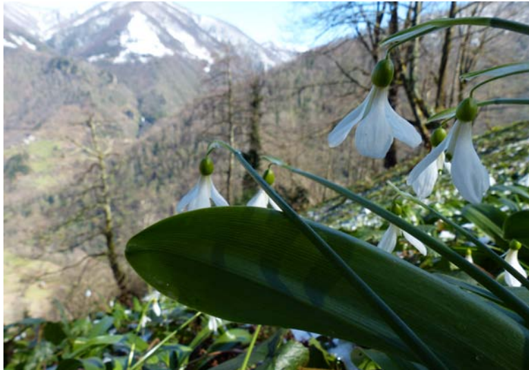
Galanthus krasnovii is just one of many snowdrops that will be seen on this tour