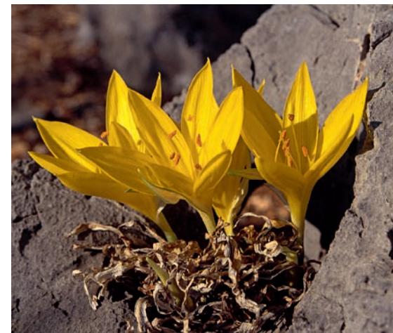
Autumn-flowering Sternbergia lutea

Also to be repeated this year is the AGS Conference that runs alongside the AGM, and this too will move to a new venue – the Holiday Inn in Stratford-upon-Avon. This hotel is