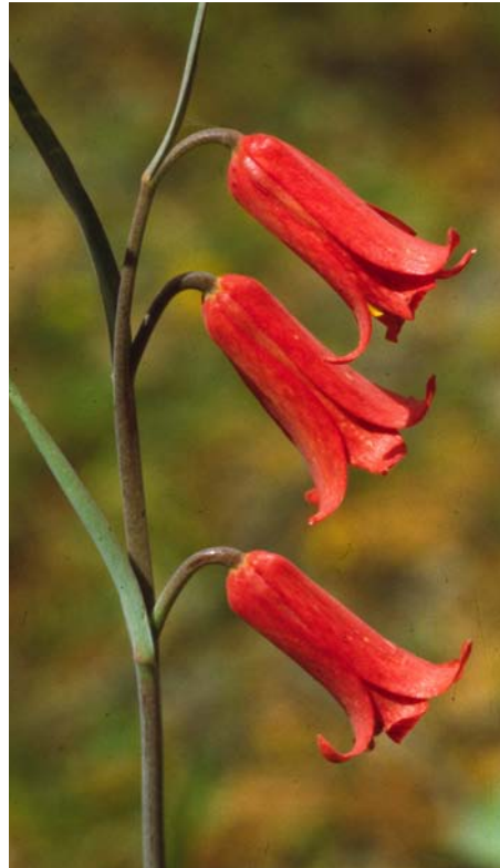
Fritillaria recurva and, below, Calochortus luteus

Colonies of carnivorous Darlingtonia californica carpet bogs alongside the Californian lady's slipper orchid. Cypripedium californicum . We'll see the hummingbird-pollinated firecracker flower, Dichelostemma ida-maia , and the perfect little orchid Calypso bulbosa .