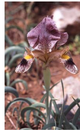
Iris medwedewii and, below, Iris sari

For further information on AGS tours please contact AGS Centre Phone 01386 554790 or email ags@alpinegardensociety.net