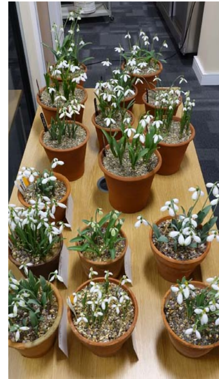
Some of the exhibited pots of snowdrops