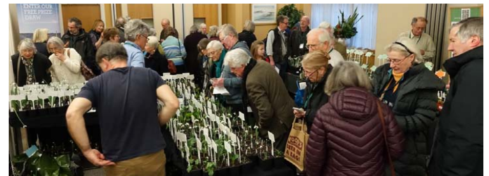
There was plenty to tempt members in the plant sales area