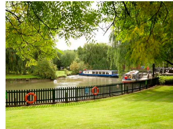
The riverside setting at the conference venue and, below, the guest lounge

A booking form for the AGS Conference is on the back page of this issue of AGS News. Alternatively, you may book on our website or by calling the AGS Centre on 01386 554790. Numbers are limited so please reserve your place as soon as possible to avoid disappointment.