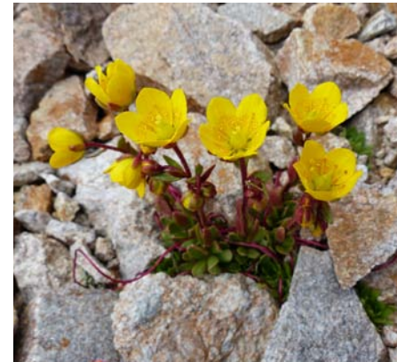
Saxifraga flagellaris subsp. flagellaris and, right, Lilium monadelphum var. szovitsianum

The botanical exploration will combine nature and the cultural elements of Peru. Almost every day will involve the exploration of remote areas by four-wheel drive vehicle. Most of the roads are paved but in places like Huascarán National Park and Colca Canyon you will travel over some bumpy gravel roads. Hotel accommodation will include breakfast, lunch and dinner.