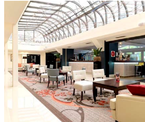
Part of the interior of the AGS conference venue, the Holiday Inn at Stratford-upon-Avon