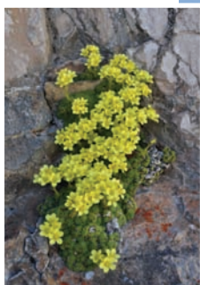
View above Fuente Dé and Saxifraga felineri